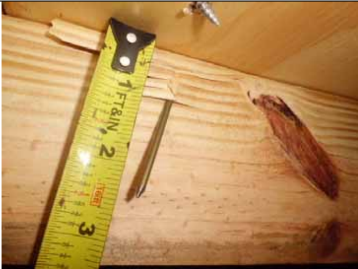
Roof deck attachment