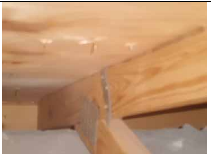
Roof to wall attachment