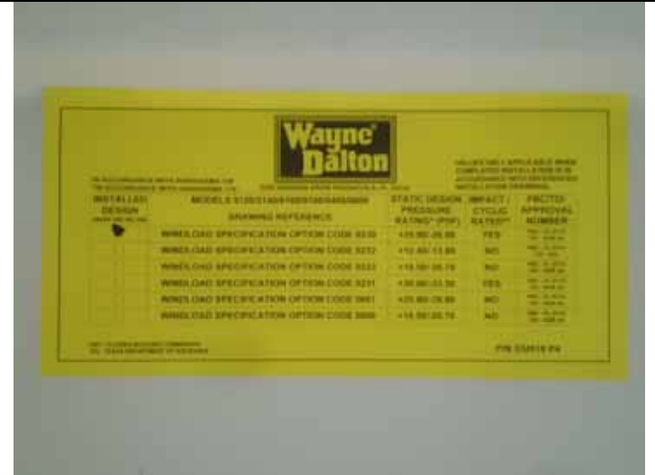
Garage door data