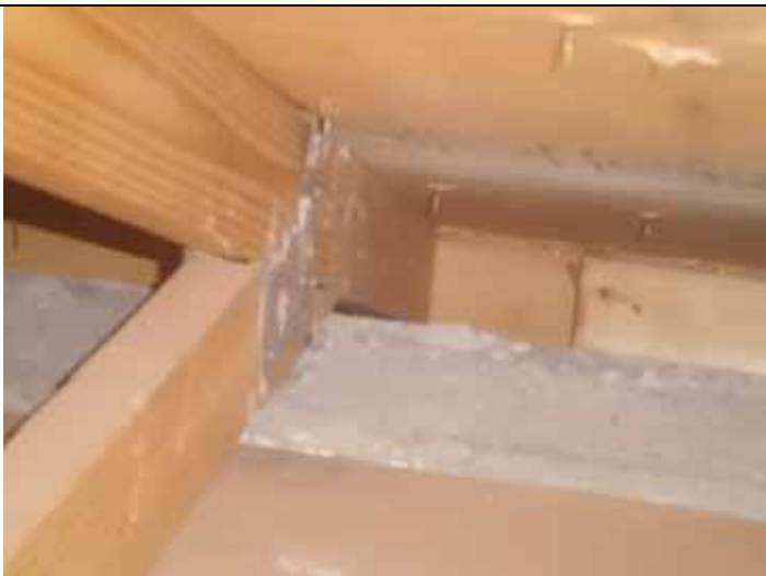
Roof to wall attachment