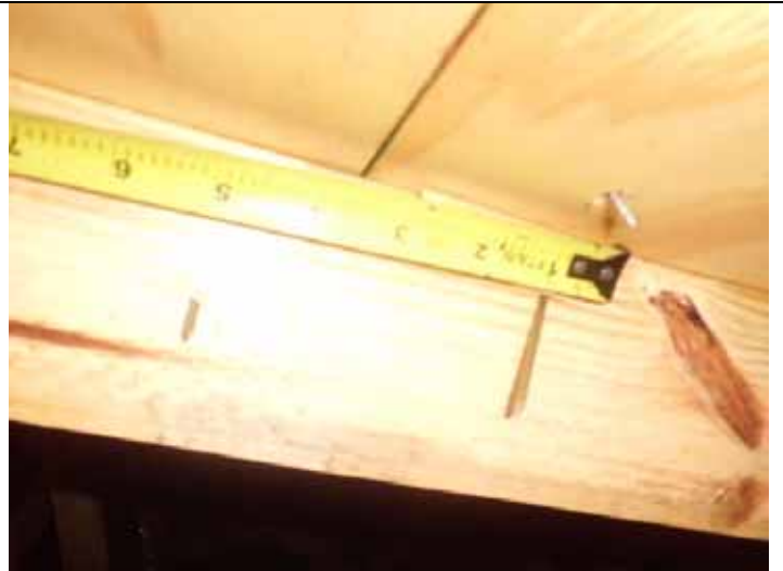
Roof deck attachment